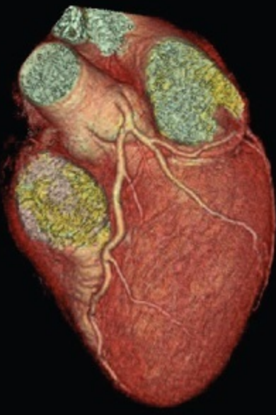
New 3D Heart CT Scan